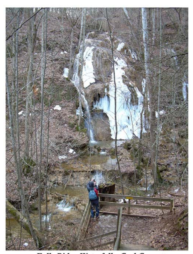
Falls Ridge Waterfall - Carl Cornett

lot behind and lined up for Carl's group picture in the meadow. Around 2 PM, we were on our way. By this time the sun was out for good; later on, the wind seemed to pick up – or was it just the difference in elevation or orientation that made the difference? - but we really couldn't have wished for nicer weather.