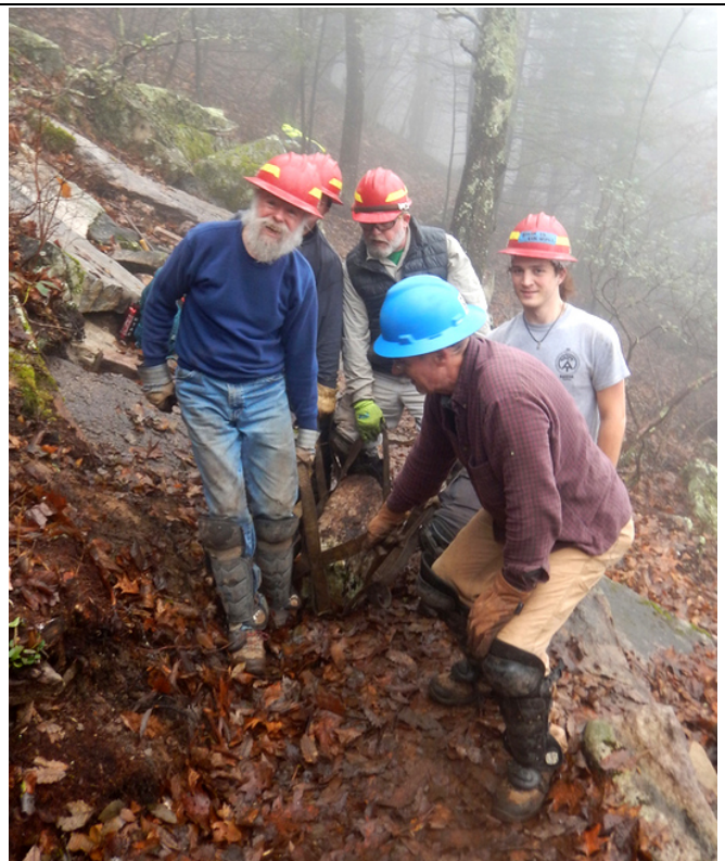
This was a super team