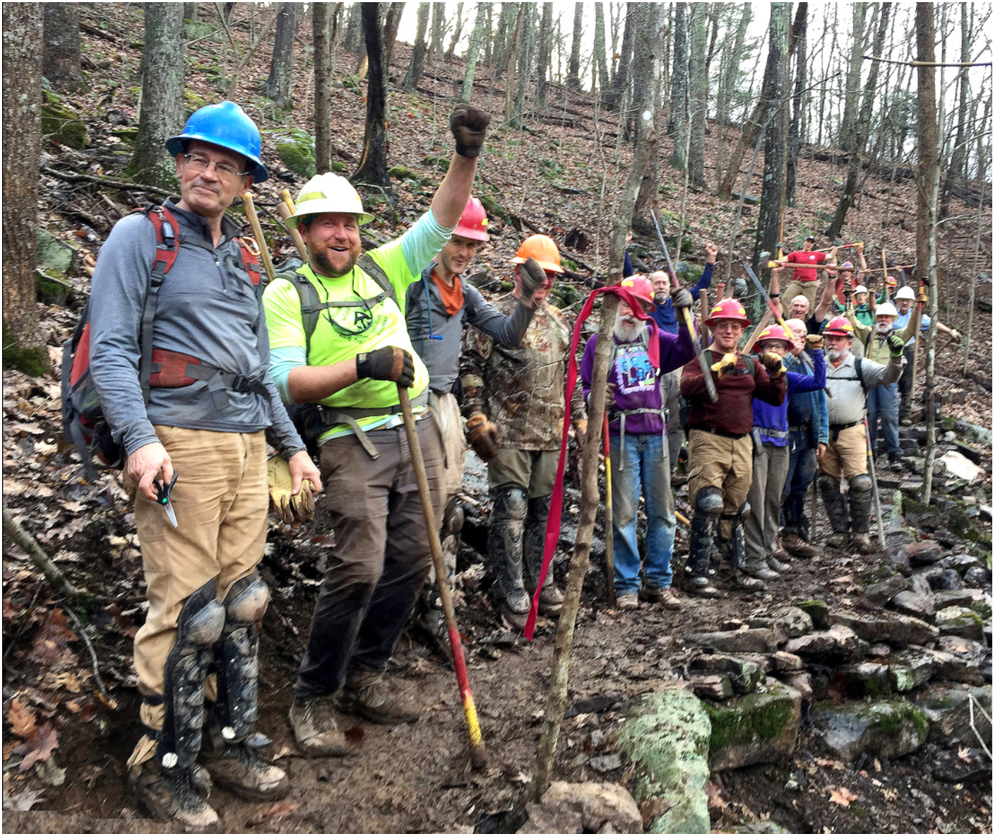
See that cut ribbon flying in the air!