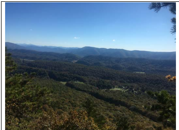
View from Dragon's Tooth