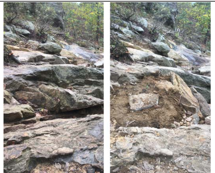
The Hole is Gone

Cooler weather was the order of the day as we headed up the Dragons Tooth trail to the AT. This work hike I wanted to try something new. On the trail, erosion had opened a hole in the trail all the way to bare rock. It was difficult to climb over in dry weather and dangerous in wet weather.